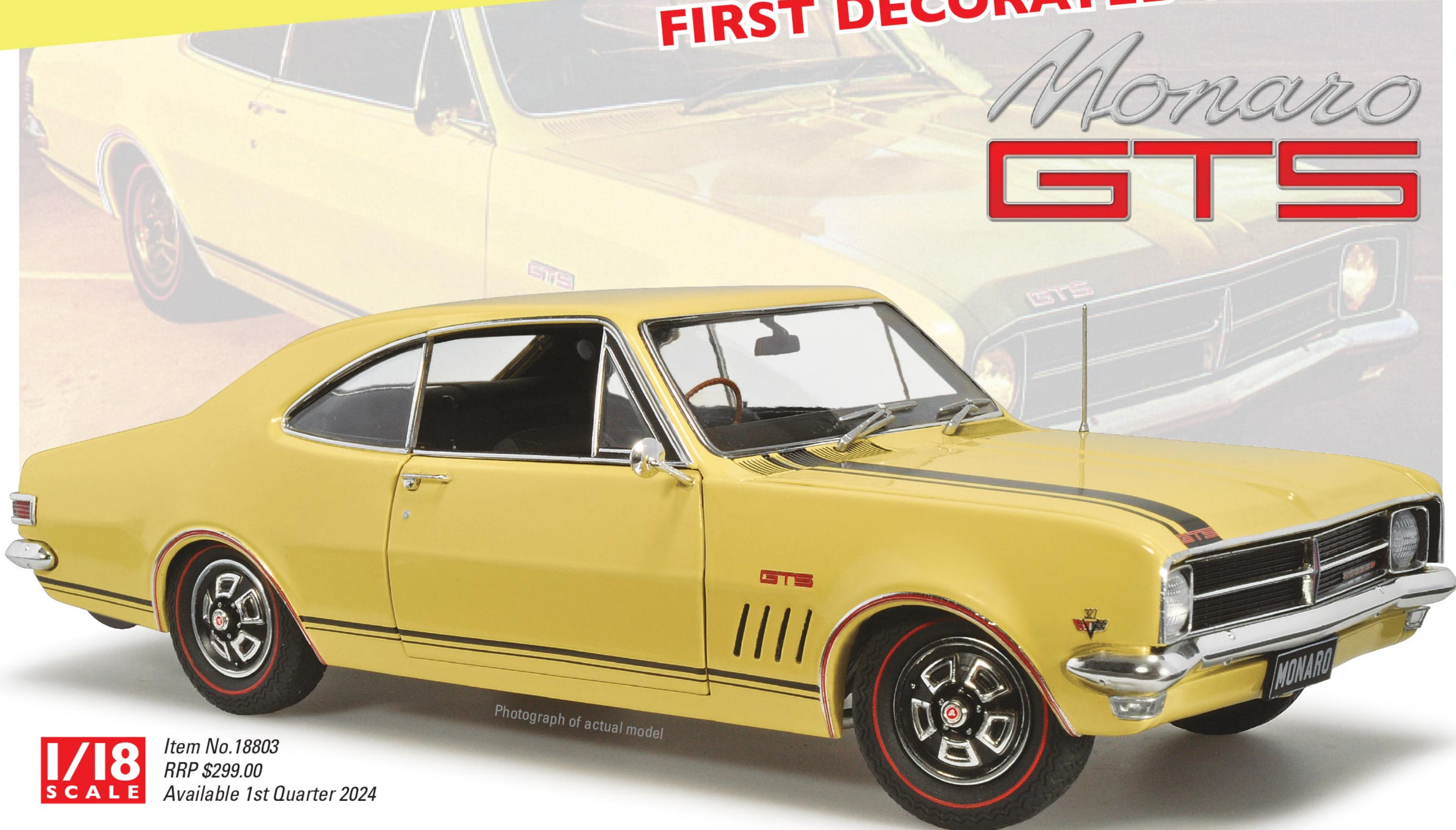
Photograph of actual model