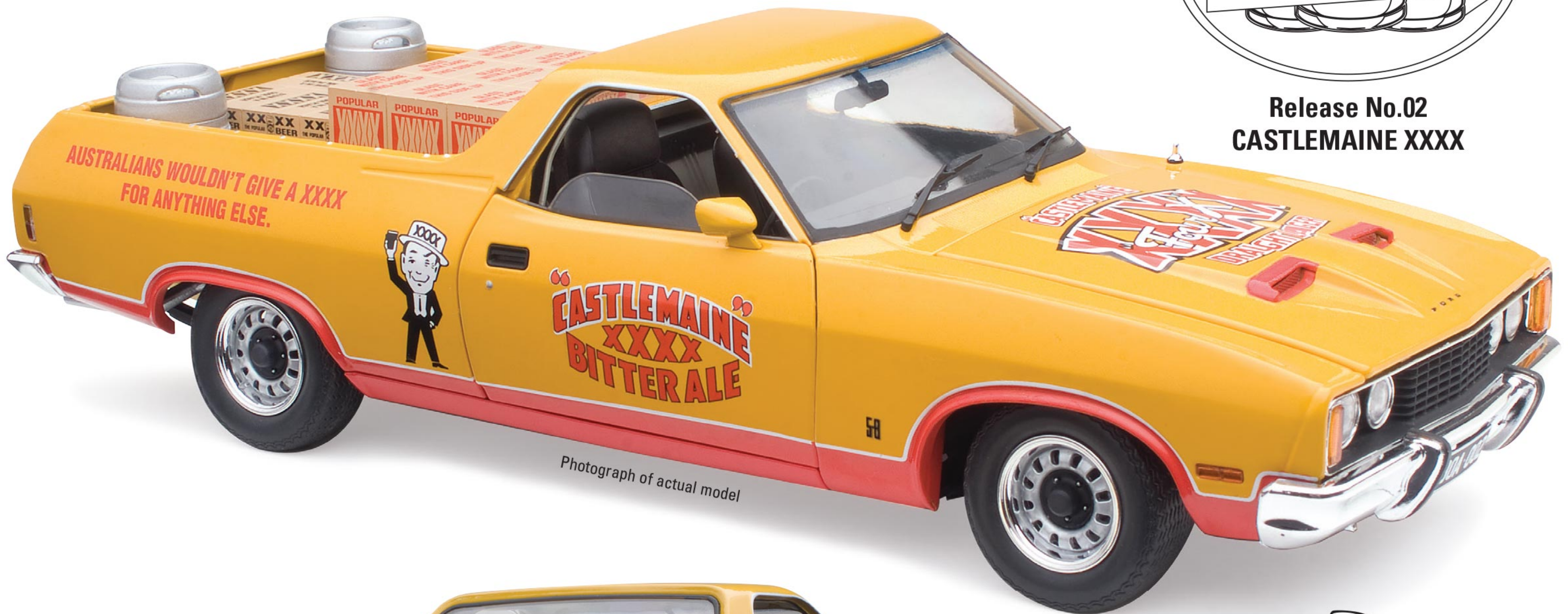
Photograph of actual model