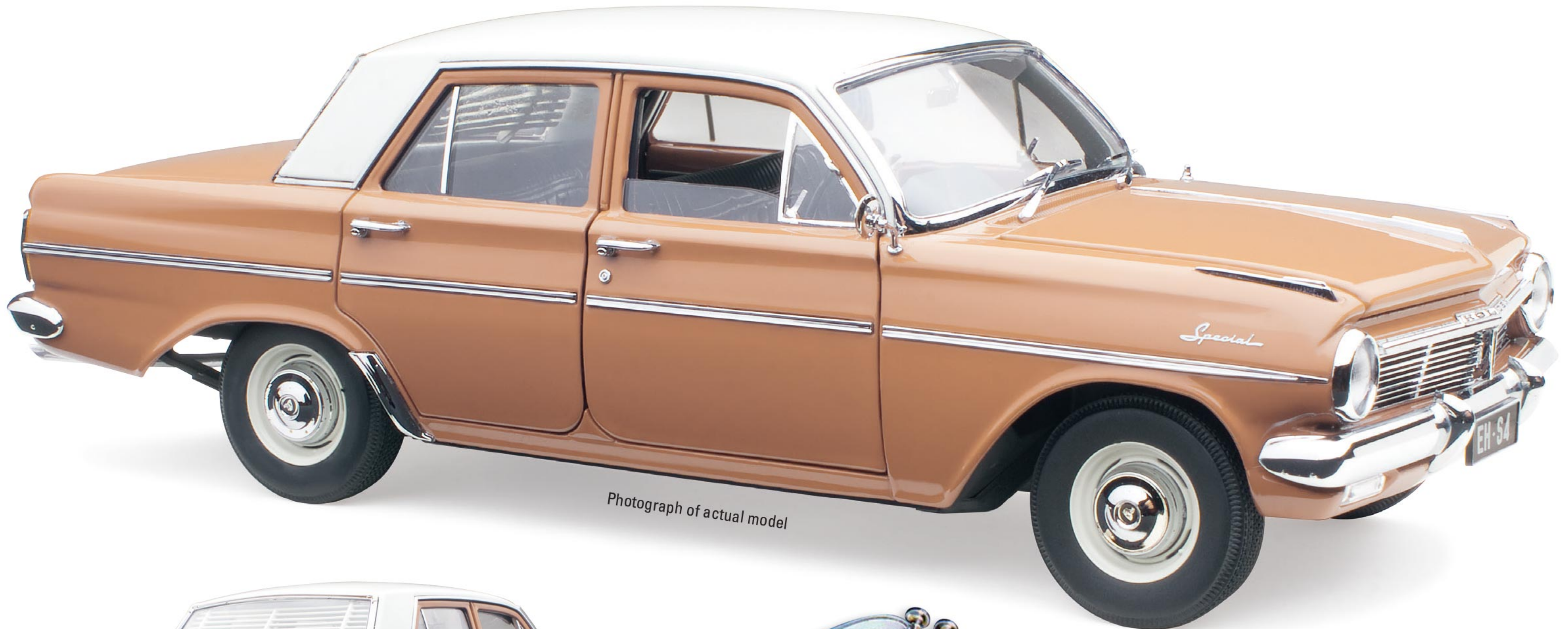
Photograph of actual model

SCHEDULED PRODUCTION OF 1000 PIECES WORLDWIDE