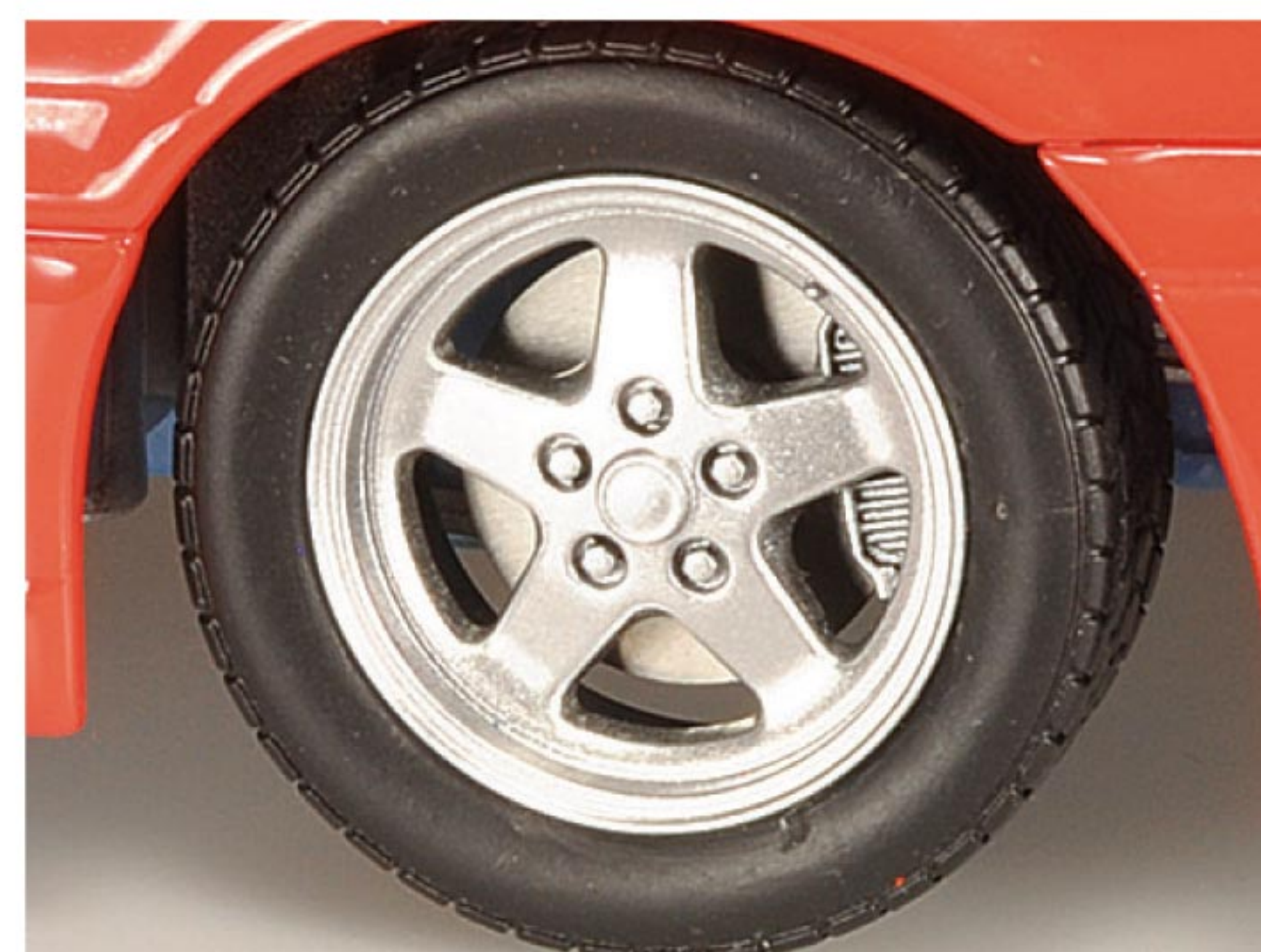
The 16 by 7-inch alloy wheels on 225/55 VR16 tyres have also been faithfully replicated.