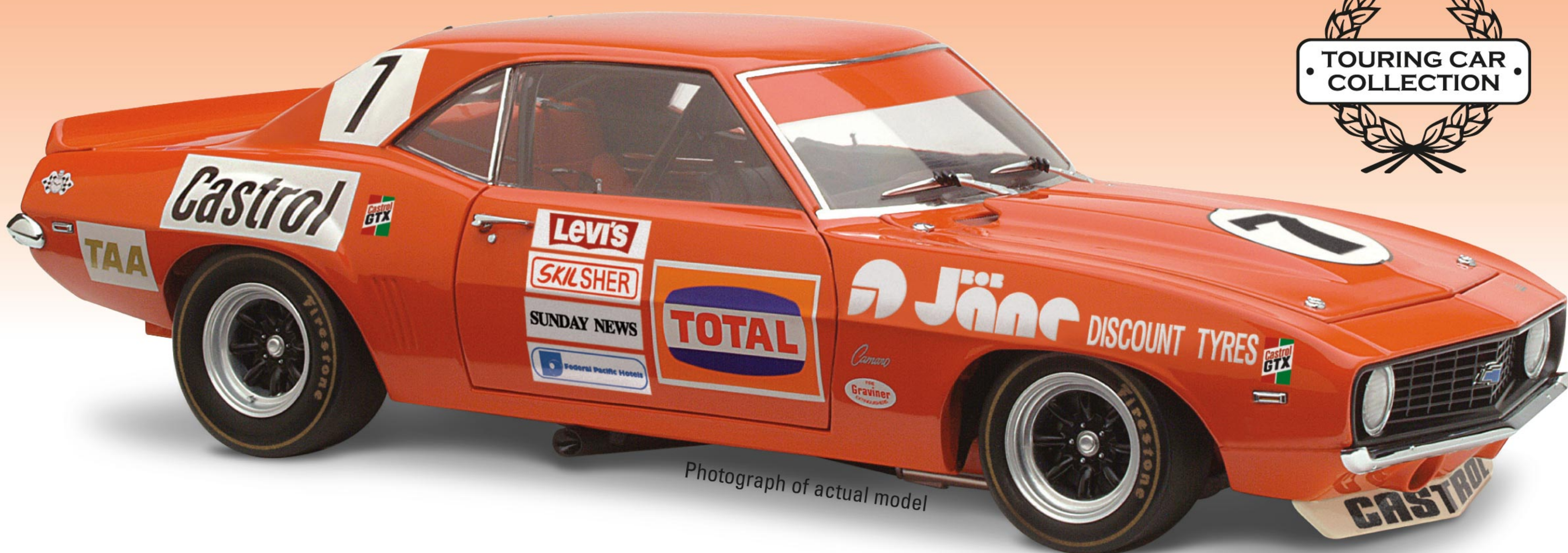
Photograph of actual model