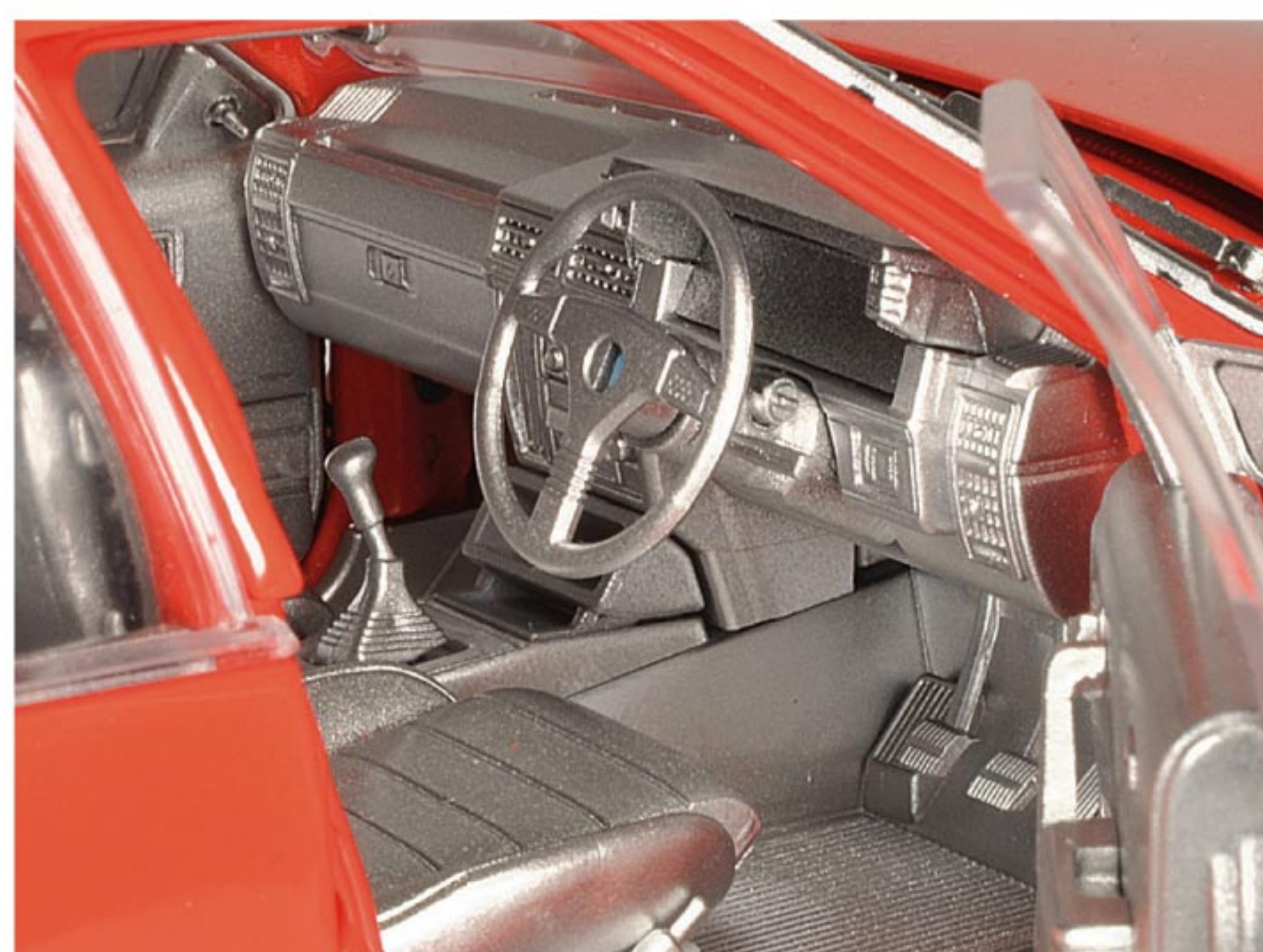
The highly detailed cabin interior provides the authentic look and feel of this classic car.