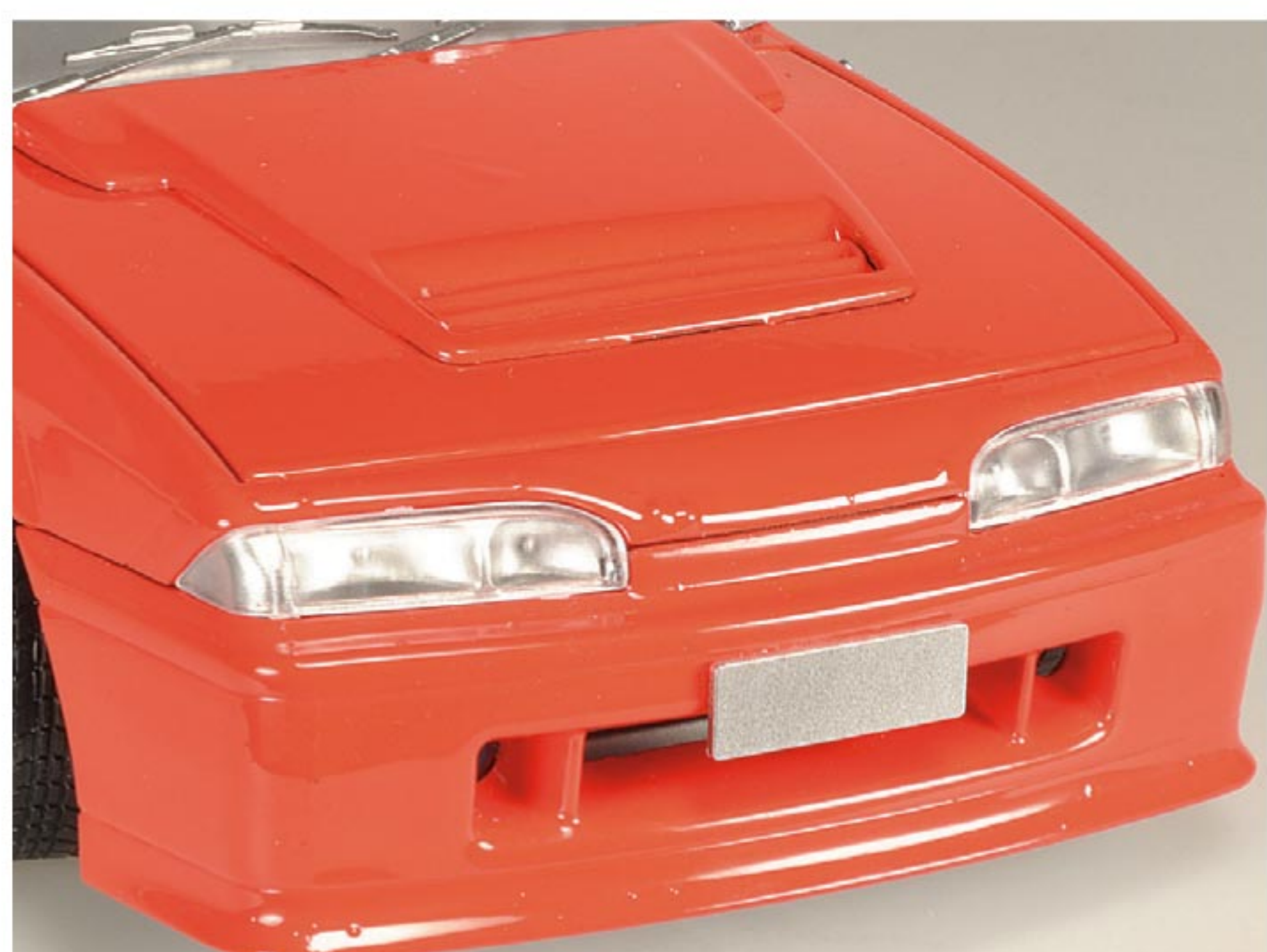
The Tom Walkinshaw Racing designed Aero Kit has become an iconic feature of this car.