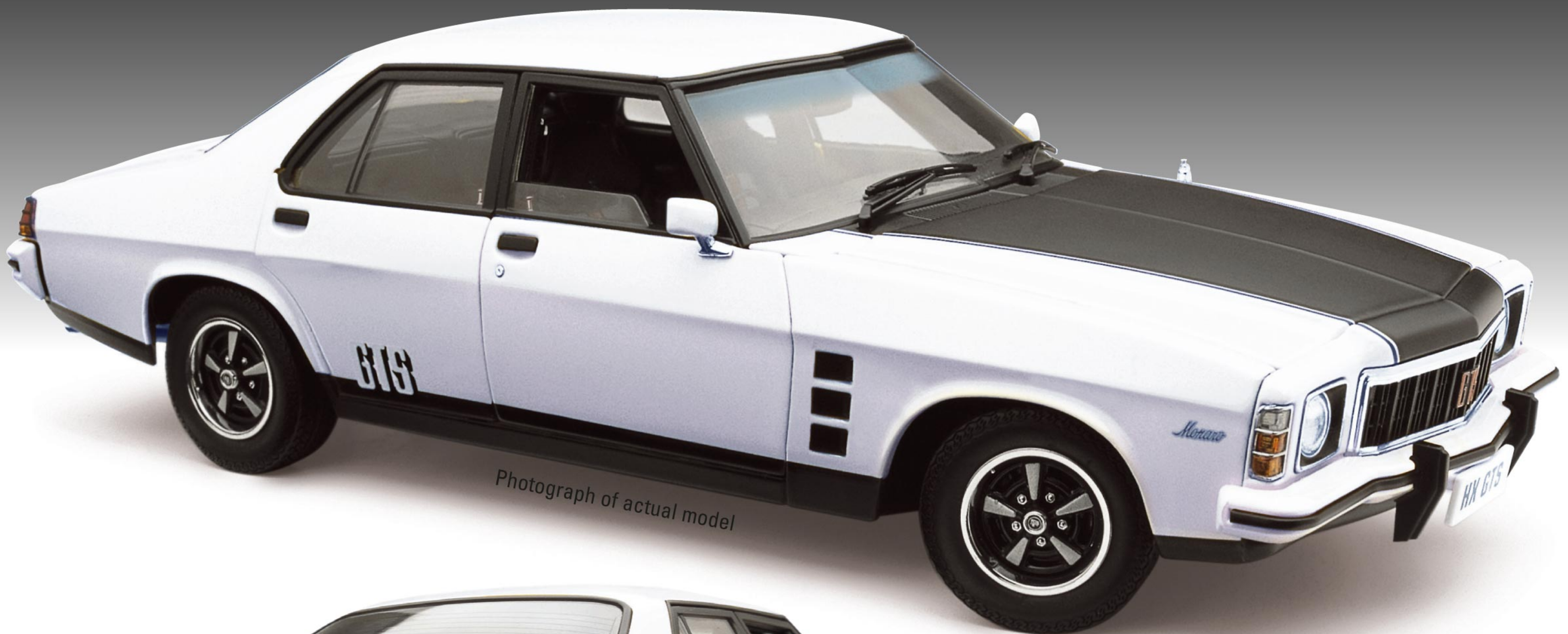
Photograph of actual model

SCHEDULED PRODUCTION OF 750 PIECES WORLDWIDE