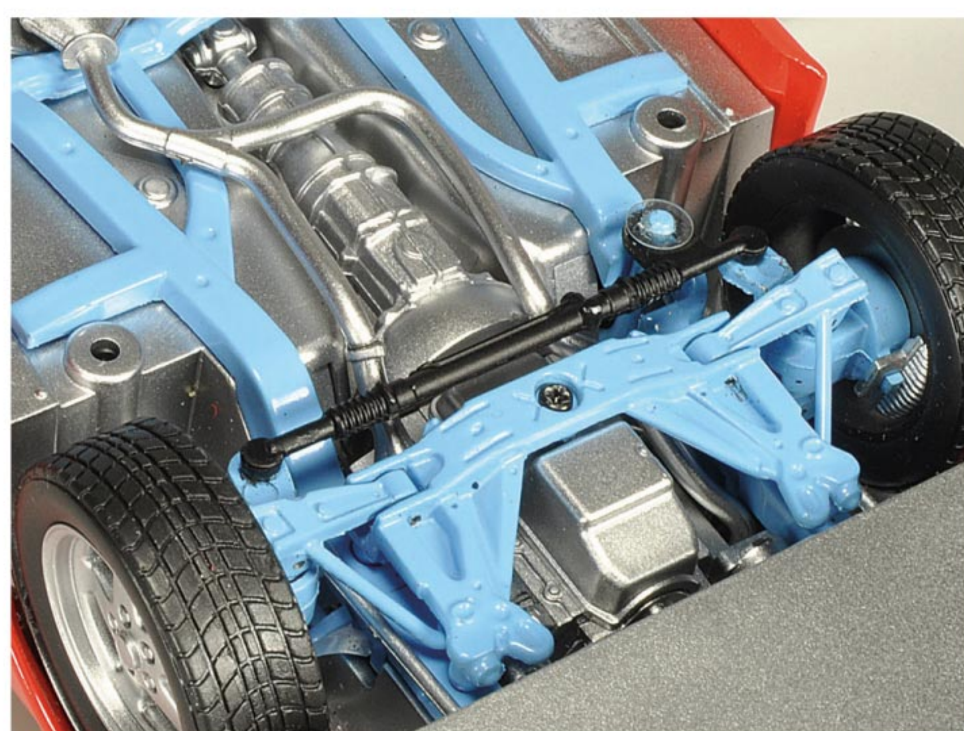
Working suspension is a feature amongst many others that you can see on the Chassis.