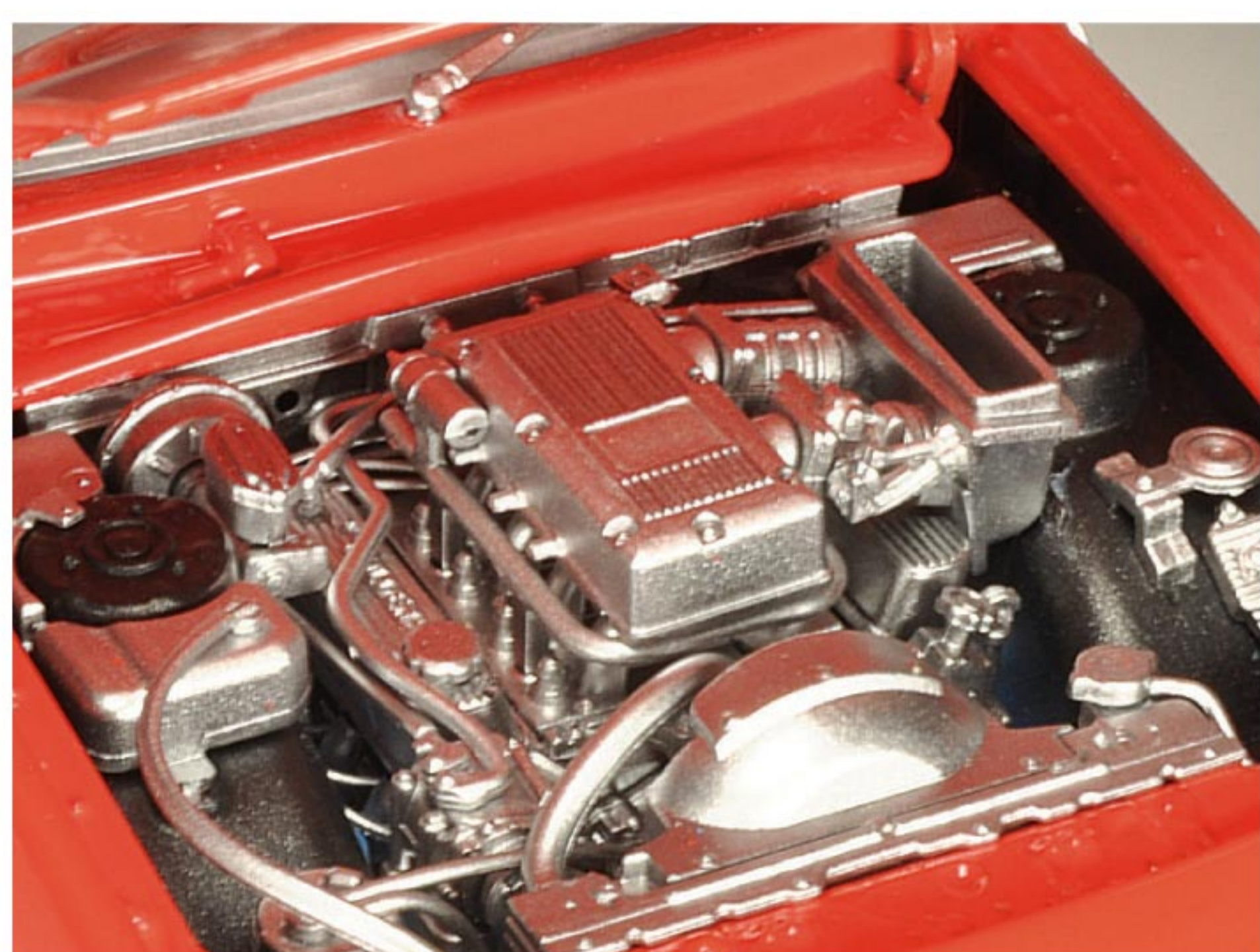
The highly tuned 5-litre V8 with Delco EFI has been replicated in great detail on this model.